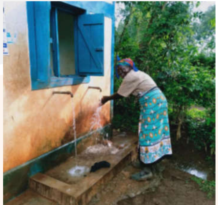
Beneficiary using tap water after the restoration of the borehole.