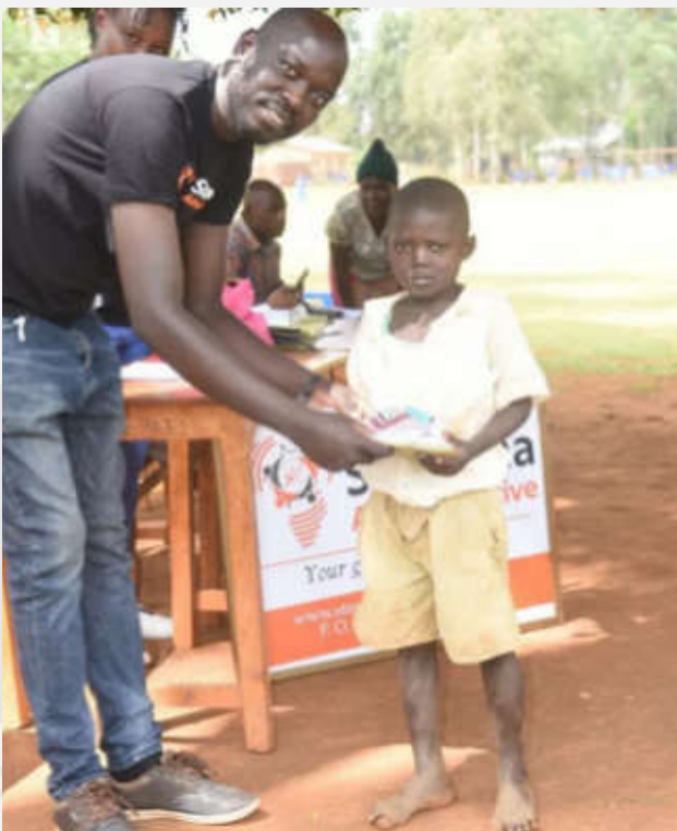
Beneficiary receiving new uniform from Stawisha Staff

We documented touching stories from the pupils; indeed, a lot needs to be done to support them. A decent school uniform is a starting point for self-confidence and good academic performance. We completed the dignity restoration project in July 2022, by donating uniforms to Bar Kagwanda Primary school, Kiríndo primary, and Ulafu Mixed primary in Karemo Division, Siaya County. That made 100 donations and 100 smiles from the pupils who received the uniforms.