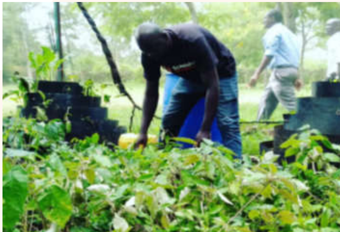
Stawisha Staff assorting tree seedlings

Stawisha Africa Initiative is actively involved in climate change response through agroforestry projects. This has been successful through the help of partnership activities and forums. To promote a greener environment in our schools, we received over 1000 assorted tree seedlings from the Siaya county Environment and Kenya Forestry offices. The seedlings were distributed to five partner primary schools. The seedlings included: Maesopsis eminii , Markhamia lutea , Bischofia javanica , Trichilia hirta , and Croton megalocarpus .