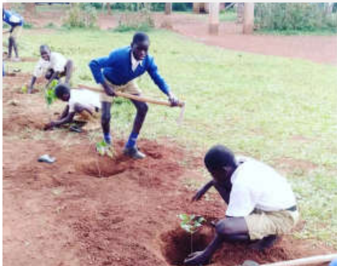
Pupils taking part in tree planting

Stawisha Africa Initiative had exciting tree planting activity with pupils from its partnering schools. We aimed to boost tree cover within our region and save our environment. We also established school environmental clubs that will help take care of the trees.