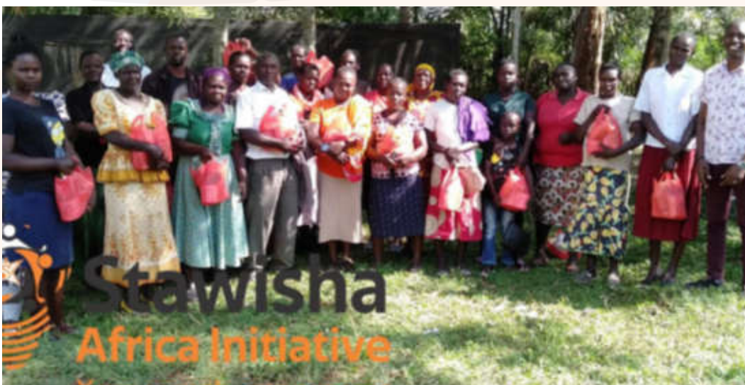
Parents posing for a group photo with packs of dry foods